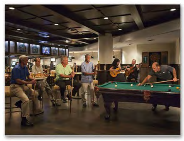
The Florida Surveyor May 2014