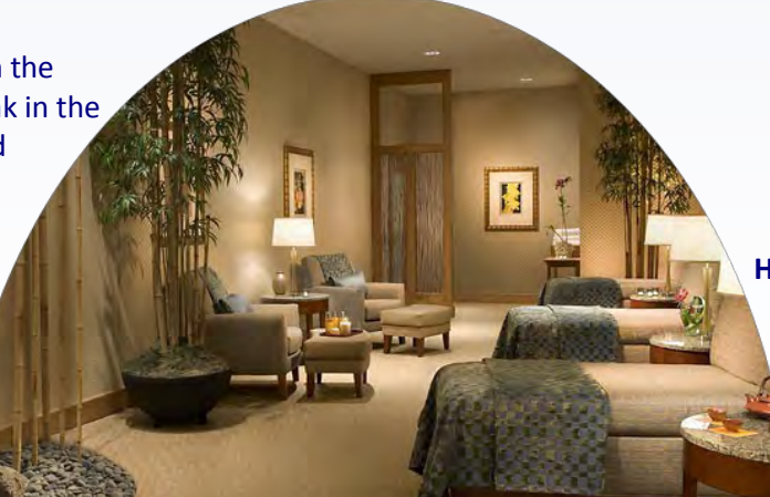
Hours of Operation:

Take a refreshing swim in the outdoor heated pool, soak in the bubbly whirlpool and find your balance in the relaxation area. Stop at Soothies at the Spa for energizing drinks and spa cuisine as you relax and refuel.